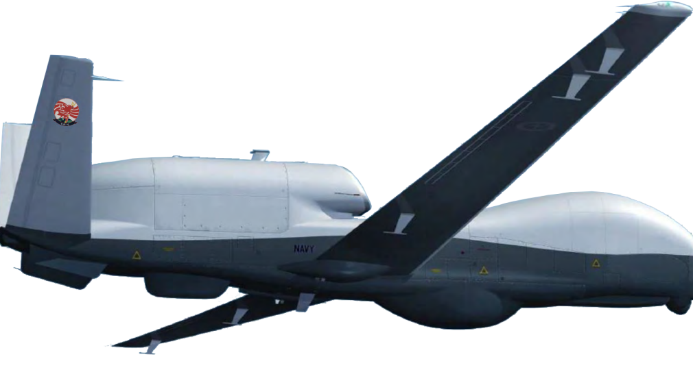
MQ-4C Triton UAV

patrol aircraft," he said. "At the time, Lockheed proposed a repurposed version of their existing L-188 Electra, and the P-3 Orion was born. The first P-3s built were delivered to VP-30 in 1962, when the squadron at that time hosted a detachment in Patuxent River, Maryland. Since then, over 700 Orions