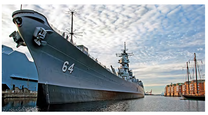
Battleship USS Wisconsin (BB-64) in Norfolk.

There is lots to do in Norfolk. Take a boat or land tour