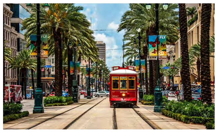
Canal Street near the French Quarter in New Orleans.

Nicknamed the "Big Easy," New Orleans has a LOT to offer! Tour the French Quarter, and visit Jackson