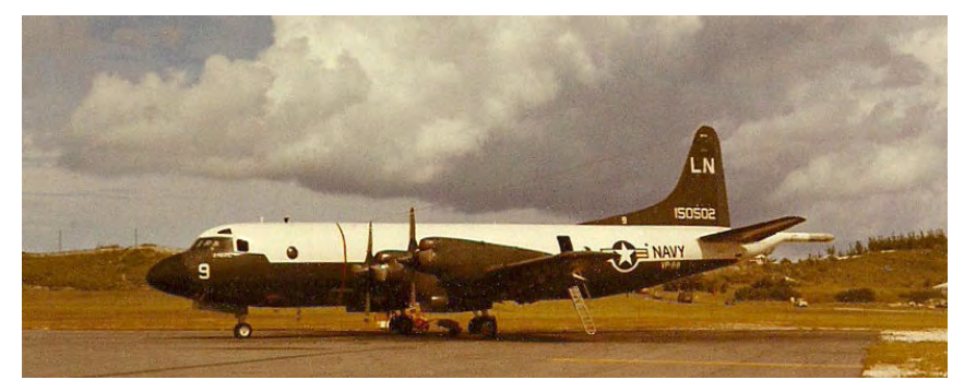
LN-9 some weeks before the crash.

The late morning of November 17, 1964, VP-45's Crew 10 manned up LN-9, one of their still new P-3A aircraft, for a routine training mission out of their deployment base at Naval Air Station, Argentia, Newfoundland. The aircraft pre-flighted without