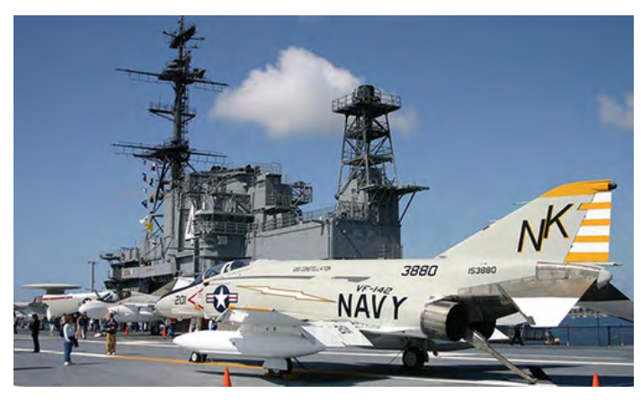
An F-4 Phantom fighter aboard USS Midway.

San Diego is known for its beaches, parks and warm