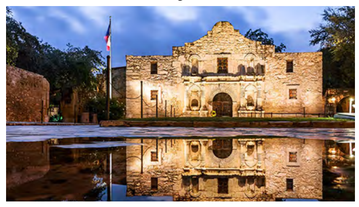
The Alamo in San Antonio.

Some of the sights in San Antonio include the River Walk that winds along the San Antonio River