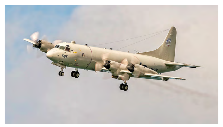
The final operational deployment for the P-3C was concluded on 9 October 2019, with the return to NAS Whidbey Island of VP 40 'Fighting Marlins'.