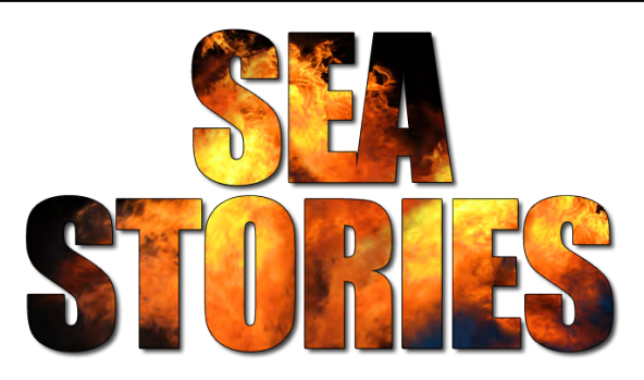
A Selection From Our Website "Sea Story" Page

maining aircraft disappeared, presumably return-