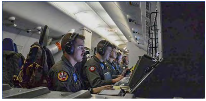
Patrol Squadron 45 Sailors conduct an anti-submarine warfare exercise aboard a P-8A Poseidon during ANNUALEX, Nov. 13.

ANNUALEX is a bilateral training exercise between the Navy and JMSDF conducted in air, surface and subsurface battlespaces. The exercise allows the nations to practice and evaluate the interoperability elements required to effectively and cohesively respond to the defense of Japan or to a regional contingency in the Indo-Asia-Pacific region, while continuing to build bilateral relationships.