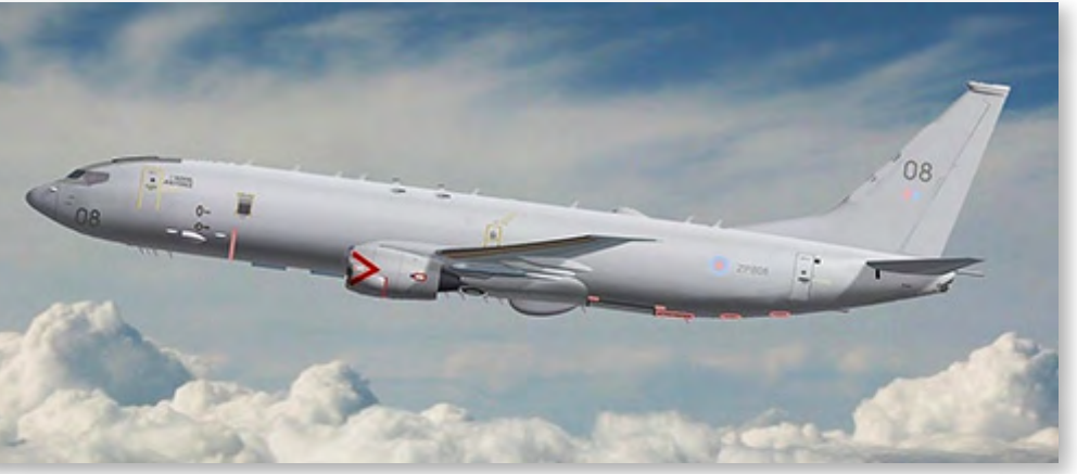
The new Royal Air Force P-8A

The Boeing P-8 Poseiden, nicknamed "Pride of Moray", made the transatlantic crossing from Jacksonville in Florida - it will operate in the Arctic and North Atlantic and can perform a search and rescue role if needed. It is the first of nine ordered by the British government of the aircraft. They will be de-