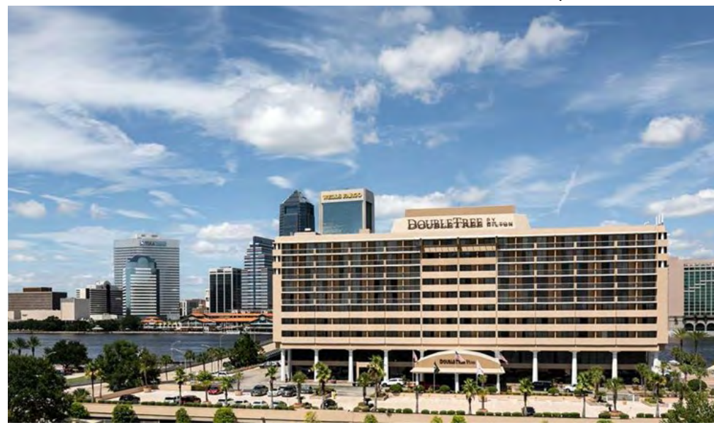
Headquarters: VP-45 Association 2020 Reunion

The cutoff date for reservations is midnight on September 19th.