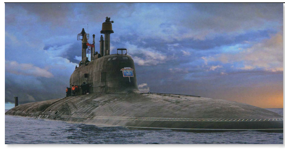
Russian subs are still a threat. K-560 Severodvinsk is a Yasen class nuclear-powered cruise has already received eight of twelve missile submarine of the Russian Navy, and the lead vessel of the class. The submarine is named after the city of Severodvinsk.

the Arctic and pushes its naval forces close to NATO territory. On one occasion last October the Russian Navy put ten submarines at sea in the High North at the same time. The P-8s will drop sonobuoys to monitor enemy submarine movements. They can operate as high as 41,000ft and as low as 200ft above the water; they will also carry Harpoon anti-ship missiles and torpedoes to defend against attack.