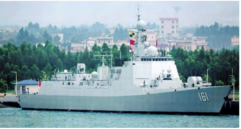
Chinese Type-052D-Destroyer Hohot

U.S Navy aircraft routinely fly in the Philippine Sea and have done so for many years. U.S. Navy aircraft and ships will continue to fly, sail and operate anywhere international law allows.