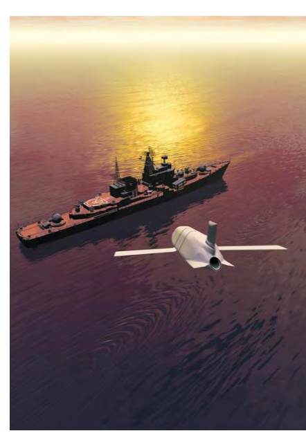
An LSRAM anti-ship missle in its terminal phase of flight.

The US Naval Air Systems Command (NAVAIR) is soliciting potential contractors to integrate the Boe-