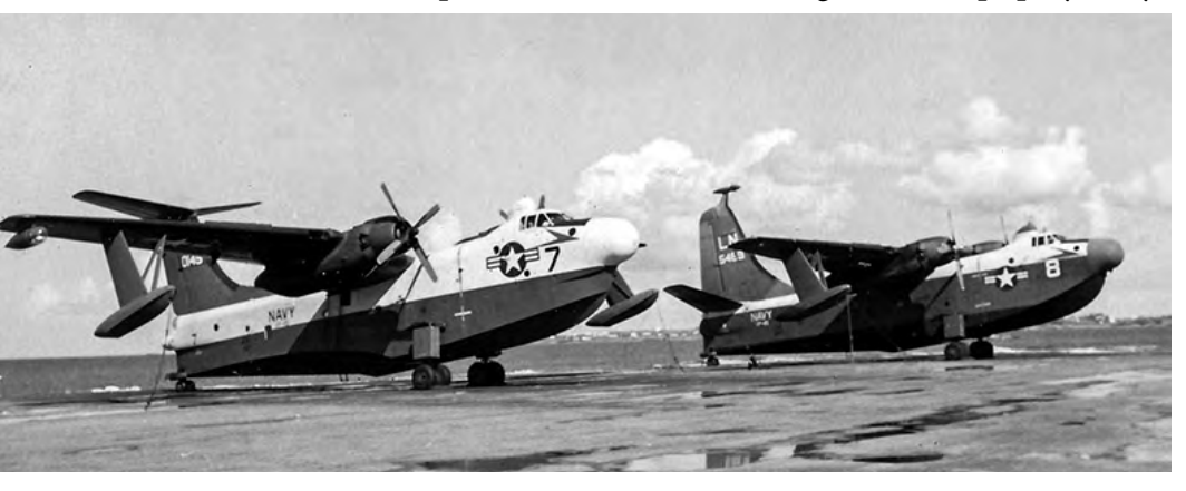
In this 1960 photograph, both P5M versions are parked side by side. LN-7 is a P5M-2 and LN-8 is a P5M-1. Also note the different paint schemes.

your first trip to the flight line, is that there seemed to be two different models of aircraft among the 12 brand new "Marlins" parked in the hangar and on the ramp. One had a a vertical tail fin with the horizontal stabilizers (or planes) mounted low just above the rear gun turret. The other version, arguably better looking, sported a "T-Tail" which reposi-