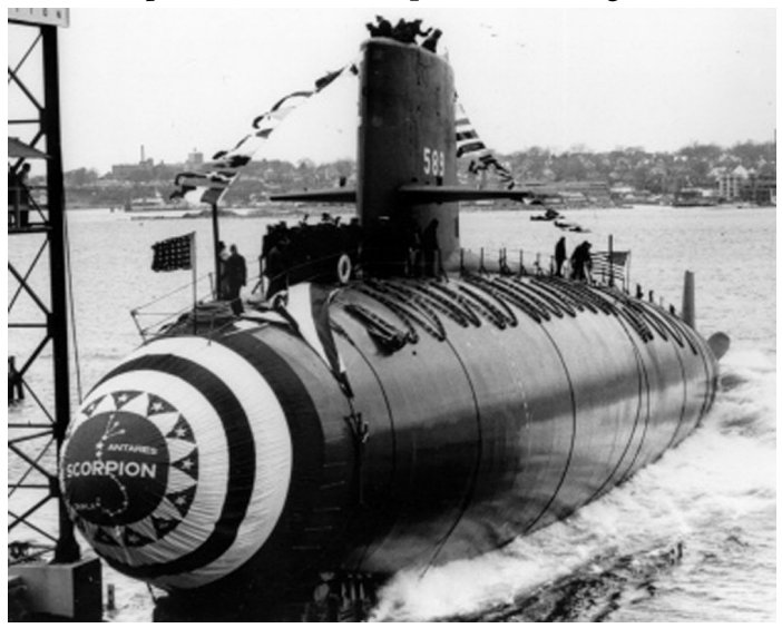
19 December 1959, USS Scorpion launching at Groton, CT.

The Israeli submarine INS Dakar, the ex-HMS Totem (P352), was lost with her entire 69-man crew while enroute to Israel on 25 January. Despite extensive searches, it was not until 1999 when her wreckage was located at a depth of 9,800 feet between the islands of Cyprus and Crete. Launched in 1961, the French submarine Minerve (Q248), one of eleven Daphné-class boats, was lost with her entire 52-man crew on 27 January in bad weather while returning to her home port of Toulon. The location of the wreck was discovered in 2019, 24 nm south of Toulon. The Soviet Golf II-class submarine K-129 sank on 8 March, 1,560 nm northwest of Hawaii with the loss of all 83 crewmembers. Six years later, using the cover story that the salvage ship USNS Hughes Glomar Explorer (T-AG-193) was engaged in commercial manganese nodule mining, the CIA recovered part of the submarine from a depth of 16,000 feet in what was known as Project Azorian. The fourth submarine lost that year was the USS Scorpion (SSN-589), reported missing with all 99