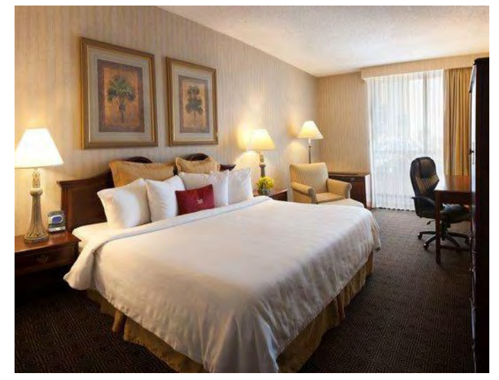
Typical Standard Room at Hotel

Cancellation policy : If you must cancel, you can up to 48 hours prior to your check-in date without penalty. So, go ahead and make your reservations now!! Note that rates quoted are available up to three days before and after the reunion!!